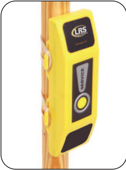
Beach Butler can also be mounted with rubber bands, Velcro strips or optional umbrella clip.