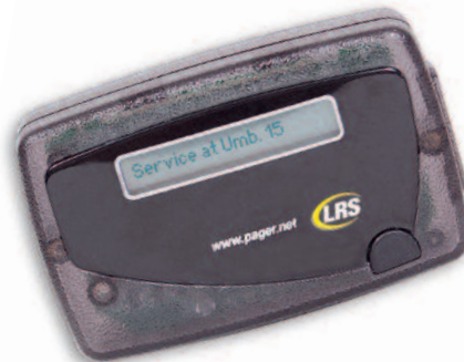
1-Line Rechargeable Alphanumeric