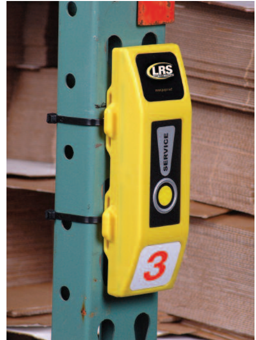
Butler XP mounted with zip ties