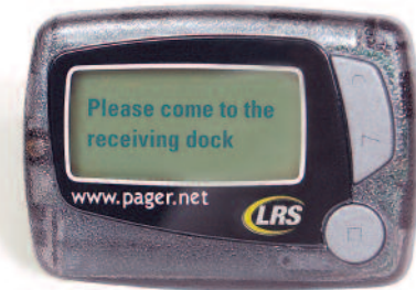
Battery-Operated Alphanumeric Pager