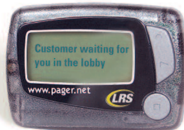
Battery-Operated Alphanumeric Pager

Maintaining constant contact between manufacturing employees can be a daily challenge. Improve efficiency and productivity in manufacturing operations by equipping managers, supervisors, technicians, and other key personnel with the tools to communicate instantly and effectively, no matter where they are onsite.