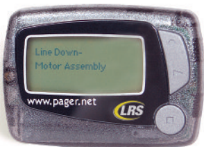
Battery-Operated Alphanumeric Pager