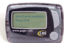
LRS Alphanumeric Staff Pager