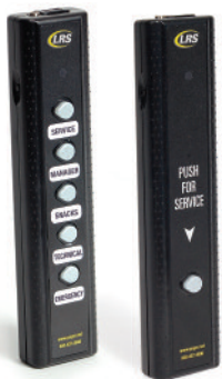
Butler II Pushbutton Paging Transmitter

That way your guests can relax...and so can you.